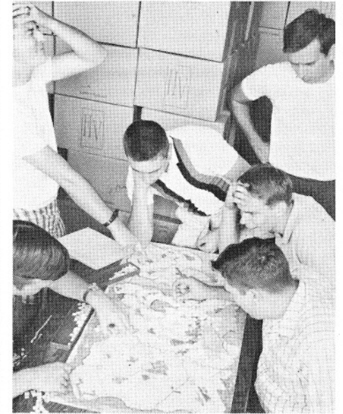
BOB'S BLUNDER: Consumer Panel testers intently analyse a strategic mistake during an exhaustive test game of a Blitzkrieg prototype.

Basically a two-player game, players must attack and defend over every type of terrain imaginable - from invading rocky-bound coasts to holding up in mountainous areas. Combatants must also cross the Great Koufax Desert (so named because it is sandy) to sieze enemy replacement centers. Judicious use of air power often turns the tide of the struggle - combat occurs fast and furiously keeping players on their strategical toes. "Blitzkrieg" has